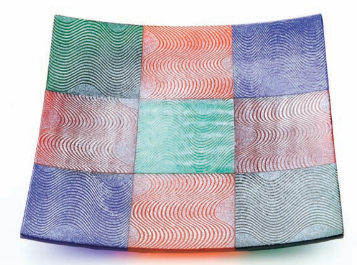
Figure 1: Fused and slumped plate with sgraffito surface, 1.5 x 9.375 x 9.375 in (3.8 x 23.8 x 23.8 cm).

At Bullseye we call the smaller scale non-sheet forms of our glass "accessory glasses."